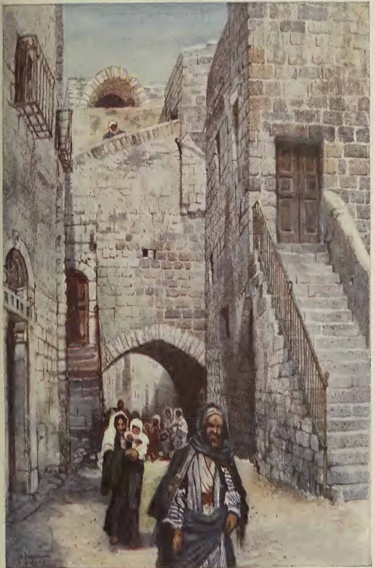
A Street in Bethlehem.